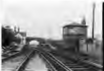
Norton Station in 1970