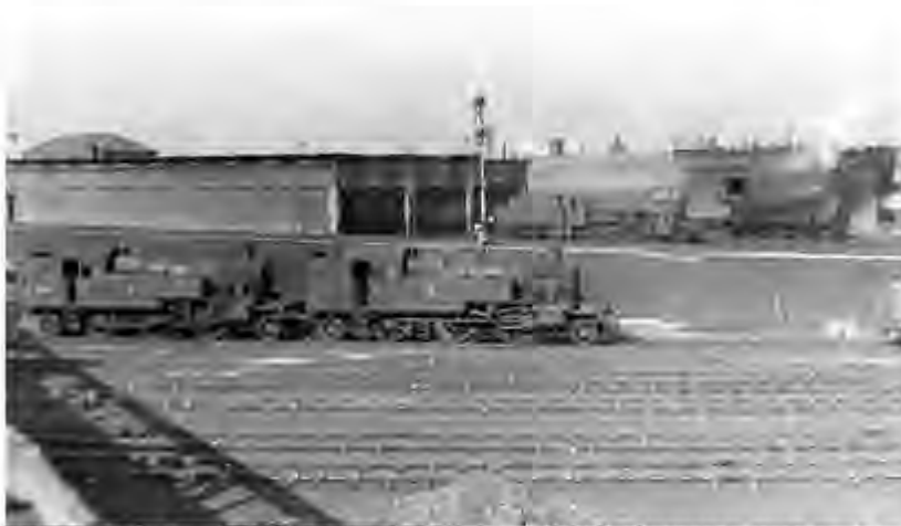
A view looking north at 8D on the 6 th of January 1961. In the foreground can be seen the sidings on which locomotives were often stabled. Beyond the St Helens line spur is the shed itself - Photo by E Bellas

During the Second World War the shed was extremely busy and the loco crews found themselves travelling further afield than the previously had done. On the 1 st of January 1948 the shed became part of the nationalised British Railways (London Midland Region). British Railways kept the LMS shed codes and so Widnes remained as 8D. Little changed in terms of the duties