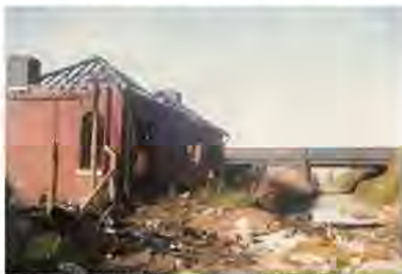
Farnworth & Bold Station as seen in 1983.

Sat 14 th and Sunday 15 th of May 2011 – Manchester Museum of Transport.