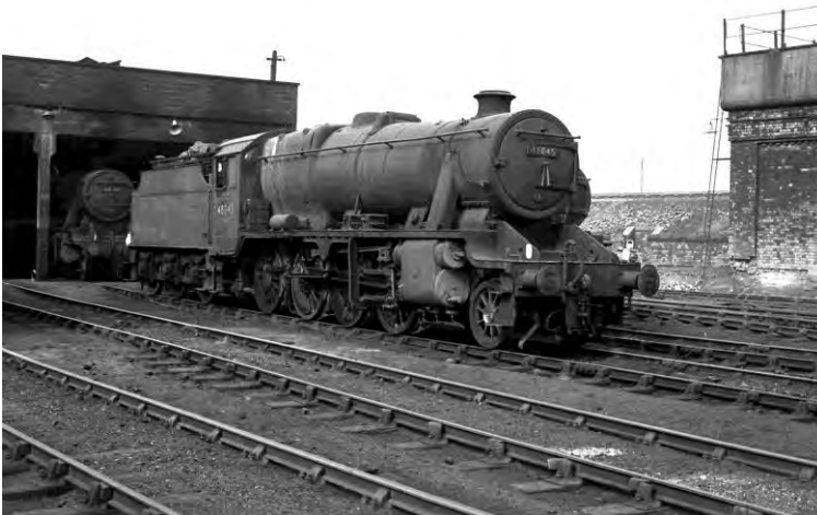
On the 20 th of September 1963 ex LMS Stanier 8F Locomotive number 48045 stands outside Widnes Shed.

Members then enjoyed a buffet lunch and were able to share stories and information. All agreed that 2012 would be a good year for the 8D Association.