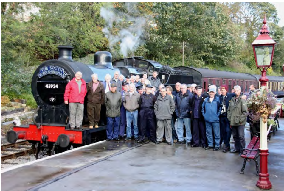
A gathering of the railwaymen and guest who attended the event on the 18 th of October 2011.