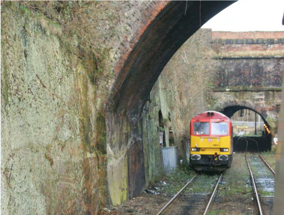
Class 60 Locomotive Number 60 011 in DB Schenker Red Livery runs around the Festive Jingle Jangle Railtour at the historic location of the Liverpool & Manchester Railway Moorish Arch, Edge Hill on Saturday 17 th of December 2011.

On Saturday 17 th December 2011 I got to travel along the former St Helens Canal & Railway Companies Warrington and Garston Railway, the Low Level Line as it is now referred to, from Warrington Arpley to Ditton Junction. Along with the Widnes and St Helens line, now sadly just a memory, the Low Level line was an important part of my childhood years. I spent many hours adjacent to it at Johnsons Lane, Carterhouse Junction and Widnes South. As I watched trains pass along the line I dreamed of travelling on it but I am of a generation that missed that chance as regular passenger services had ceased nearly two years before I was born. Even in my adult years I have still had a yearning to travel on the Low Level.