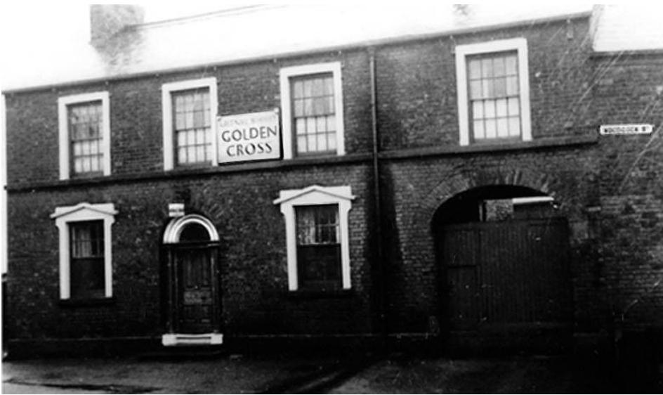
The Golden Cross pub in Woodcock Street, 'Pudding Bag', Sutton