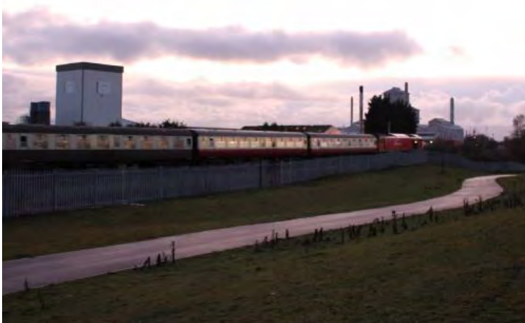
The Festive Jingle Jangle Railtour heads west along the Widnes Deviation in the gloom of a late winters afternoon on the 17 th of December 2011.