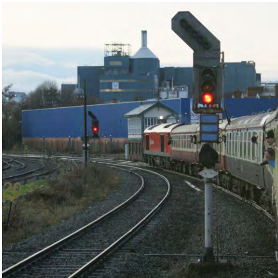
The tour departs from Warrington Arpley and heads to Ditton Junction.

The next part of the tour was the real highlight for me. After passing through Warrington Bank Quay we ran into the Walton Old Sidings. A Class 31 number 31 601 was attached to our rear. It then hauled us to Arpley and onto the Low Level line. We ran up to the easternmost reaches of the line at Latchford. From here we could see the disused track of the line heading off to Skelton Junction, if only it was still in use today. The 31 was taken off and after a short wait, and well ahead of schedule we set off for Ditton Junction. I got to see all of the local landmarks that I am so familiar with but from a viewpoint that I had never experienced before. The only down side was that the light was fading fast and I was not able to get good pictures. All too soon we were at Ditton Junction but I was happy to have made the trip. In darkness we travelled back to Birmingham only to then have to retrace our steps back again on a London Midland service. So much did we enjoy the trip that we are booked on another in April.