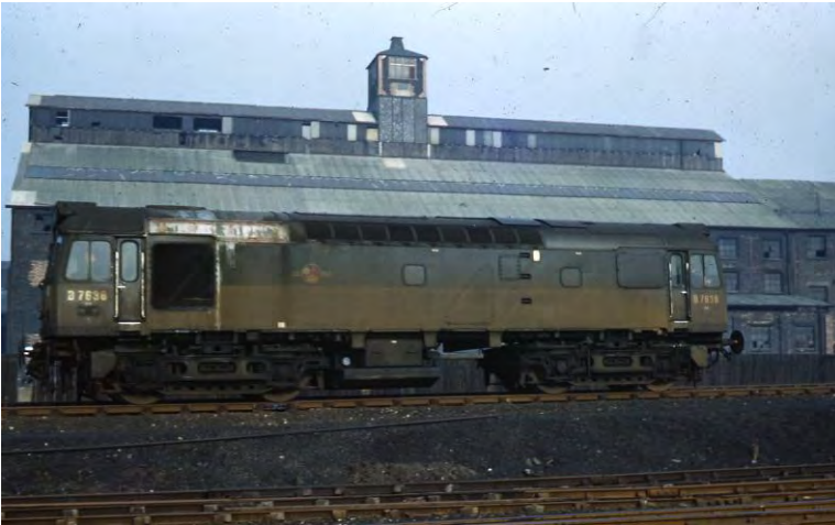
D7836 a Sulzer Type 2 Locomotive comes off the Widnes Deviation at Hutchinson Street Yard on route to Garston in 1968. Les Fifoot.

In the 1960s many railway enthusiasts ignored the diesels that had been introduced as part of the 1955 modernisation plan little realising that they in turn would disappear from the railway scene as completely as the steam engines they replaced have. There is now (thankfully) a nostalgia for these forgotten diesels. Below are a couple of pictures by Les Fifoot showing diesels on what was still a steam age railway.