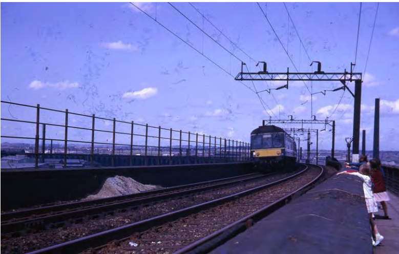
A Class 108 Derby Built DMU heads towards Runcorn running wrong line on a Liverpool Chester service in the 1960s. Les Fifoot.