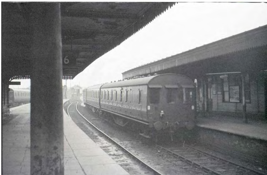
In 1962 a Manchester Oxford Road to Ditton Junction train arrives at Warrington Bank Quay. By this date there was only one more intermediate station to call at for this train before it reached Ditton Junction and that was Widnes South.

In 1868 the LNWR lifted the elevation of their Newton to Birmingham line so that it crossed the former St. Helens Railway Garston line on a bridge. In order to best serve both lines they built a new station, Warrington Bank Quay on two levels with platforms serving both lines. This new station was called Warrington Bank Quay. The platforms on the Garston line were numbered 5, 6 and 7. The first two were through platforms whilst number 7 was a bay platform facing towards Manchester. Very early on platforms 5, 6 and 7 became known as Bank Quay Low Level but interestingly the name was not the stations official title with 'Low Level' used solely for identification purposes (the line is even known today as the Low Level Line).