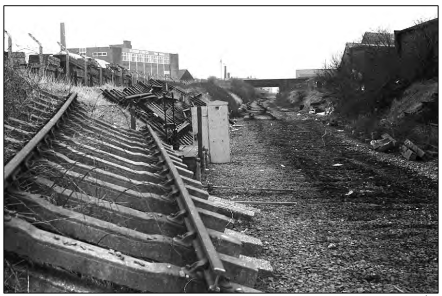
The demise of the former St Helens & Runcorn Gap Railway at Farnworth seen on 31<sup>st</sup> January 1982. The line had closed the previous November.