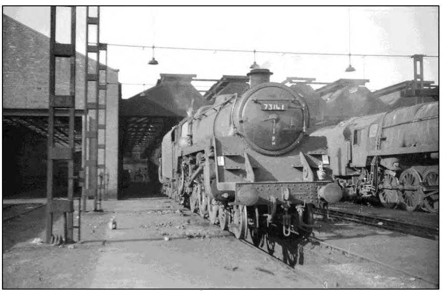
Birkenhead Mollington Street shed on 5<sup>th</sup> March 1967. British Railways standard class locomotive number 73141 is seen standing on one of the shed roads.

Memories of Birkenhead Mollington Street Motive Power Depot, The Men and The Area - Part 1 – by Dennis Flood