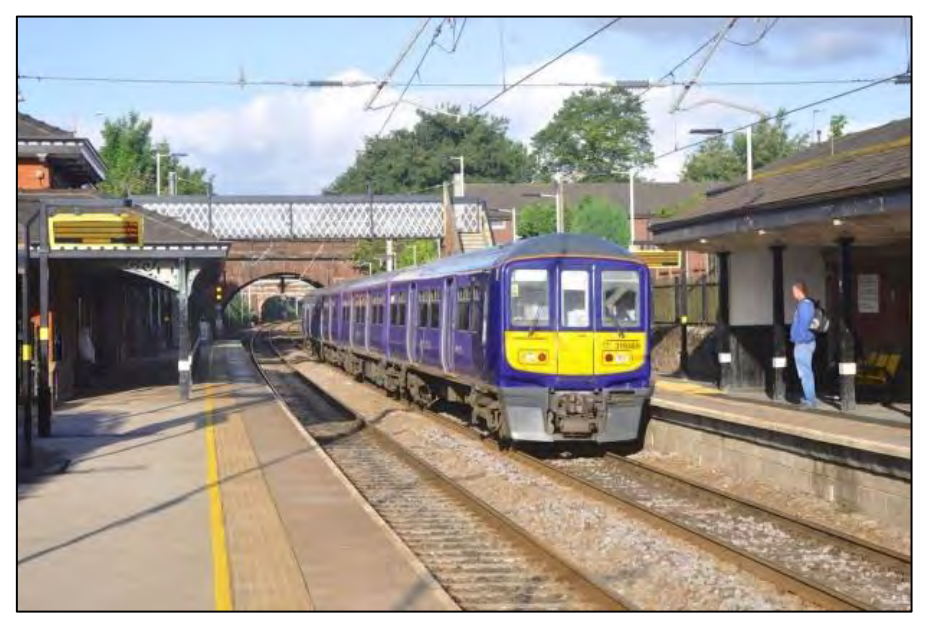
Northern Rail class 319 EMU number 319 369 is seen passing through Rainhill on 15<sup>th</sup> August 2015 with a working to Manchester Victoria.

The Liverpool Lime Street to Blackpool North diesel service was withdrawn on Mondays to Saturdays from Monday 5th of October 2015 apart from the 07.57 and 17.16 from Lime Street and the 18.03 return working from Blackpool North. A replacement electric service now operates the remainder of the service between Liverpool South Parkway and Liverpool Lime Street to Preston where passengers change on to the next train from there to Blackpool. As compensation, the Hazel Grove to Preston service is now extended to Blackpool North. There will continue to be an hourly through service from Liverpool Lime Street to Blackpool North on Sundays worked by Diesel Multiple Units. As this service is also the stopping service from Liverpool to Wigan North Western it means that no Class 319 EMU's operate between Liverpool, St Helens Central, Wigan North Western and Preston on Sundays.