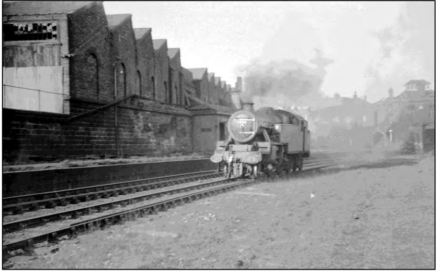
Seen passing through the remains of Birkenhead Town station on 5 March 1967 is Fairburn 4MT 2-6-4T locomotive number 42616. The engine was on its way to Birkenhead Mollington Street shed having worked a train into Birkenhead Woodside station.