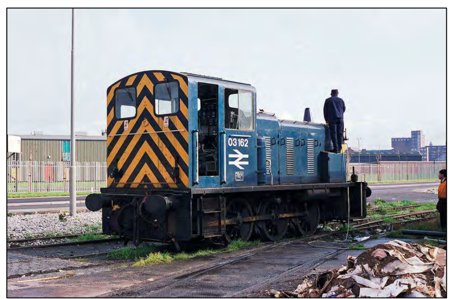
A class 03 locomotive number 03 162 at Duke Street Birkenhead on 10 November 1983.