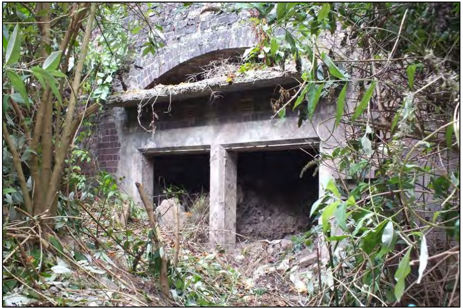
The remains of Park Lane signal box seen during the 8D visit to the Wapping tunnel on 17<sup>th</sup> October 2015.

During the visit many members commented on the sad state that such a significant historical feature has been allowed to get into. This is a view widely held and there are those who would like to see a museum developed at the tunnel site.