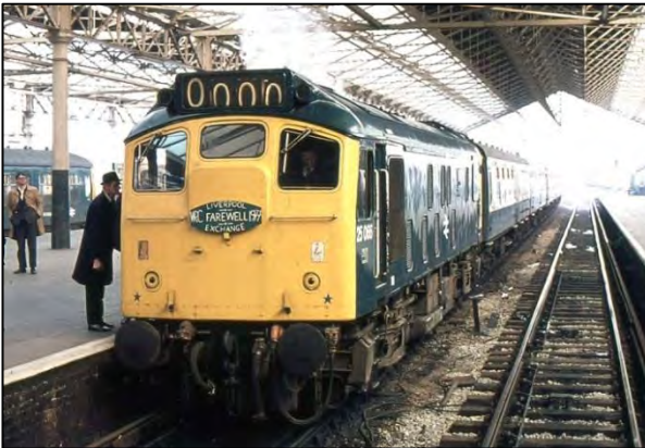
Left: The Wirral Railway Circle 'Liverpool Exchange Farewell' rail tour at Southport Chapel Street on 9 September 1977.

This year sees a number of significant anniversaries for our area of interest. Forty years ago, on 30 April 1977 Liverpool Exchange station closed, and on 3 May 1977 the underground loop and link lines opened.