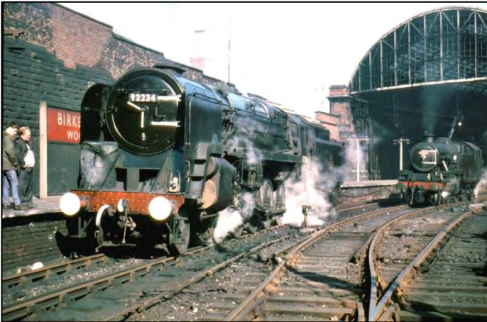
The steam locomotives and the station were both on borrowed time when this view was taken at Birkenhead Woodside on Sunday 5 March 1967.

Metro Cammel DMU. After the passengers had disembarked the train departed as an empty stock working for Birkenhead Mollington Street depot. After 99 years Birkenhead Woodside fell quiet.