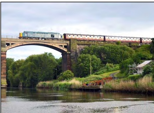
Left: The class 40 hauled rail tour of 10 June 2017 is seen at Frodsham on 10 June 2017.

Several Rail tours have passed through the 8D area in the past few months. On Saturday 10 June 2017, preserved Class 40 40145 appeared at Warrington Bank Quay, hauling a special from the East Lancashire Railway at Rawtenstall to Holyhead and return. The previous day, the same locomotive had worked the empty stock as a special train from Carnforth to Bury via Wigan North Western, Warrington Bank Quay, Chester, Shrewsbury, Wolverhampton Bushbury Jct, Stafford, Crewe, Warrington Bank Quay and Manchester Victoria.