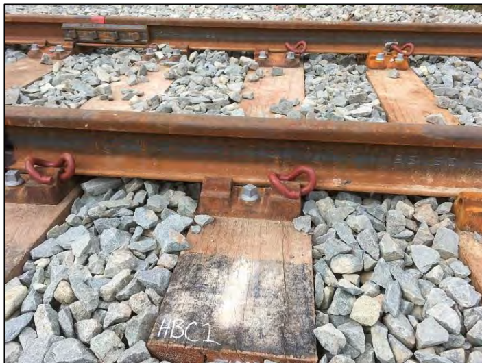
A sleeper marked HBC. This is the point from which the HBC sidings spur commences. In the future there could be up to 5 sidings capable of taking a full length intermodal train.

Halton's Unitary Development Plan process commenced in 1999, was