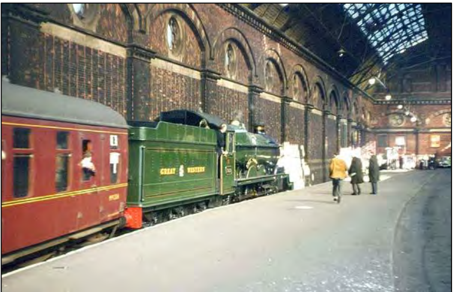
Left: 1Z65 a rail tour from Birmingham Snow Hill pulls into Birkenhead Woodside on Sunday 5 March 1967. At the head of the train is GWR Castle Class locomotive number 7029 'Clun Castle'.

The withdrawal of the main line services left Birkenhead Woodside with only local services to and from Chester or Helsby.