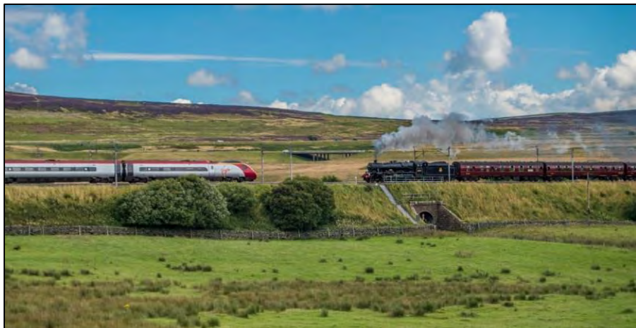
Something Old Something New – by Jamie Callaghan