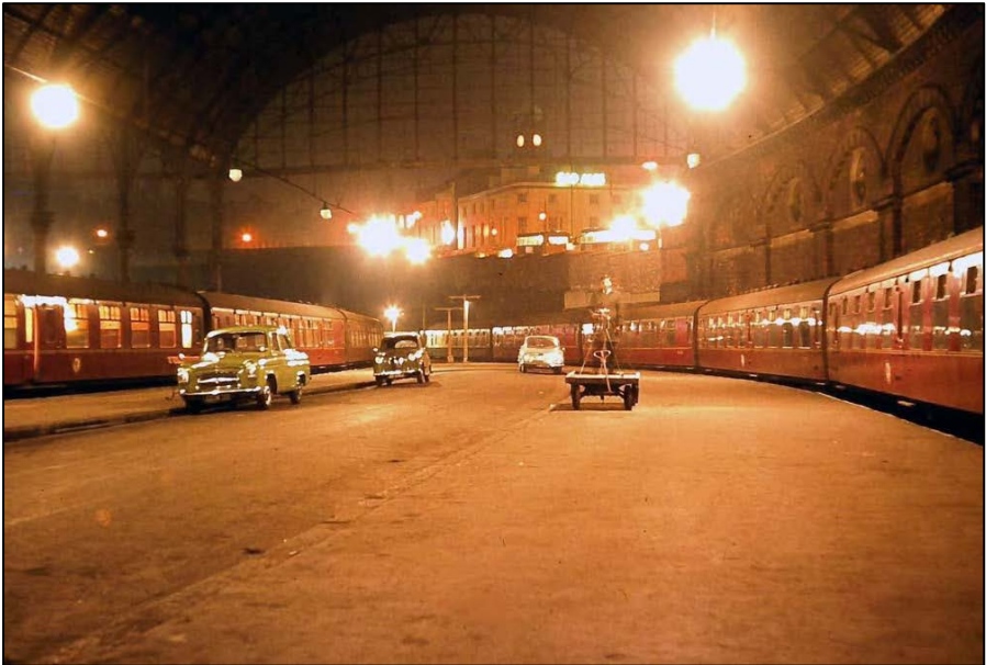
Twilight at Birkenhead Woodside. All is quiet on Saturday 4 March 1967 on the penultimate day for main line services.

During this period work was undertaken at Rock Ferry station to make it the northern terminus for passenger trains on the Birkenhead and Chester line. The former Mersey Railway linked Rock Ferry to Liverpool Central Low Level and that is why it had been chosen as the Chester line terminus. Passengers would easily be able to change trains there to reach Birkenhead Hamilton Square or to travel on towards Liverpool.