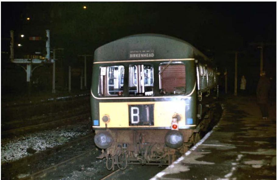
The very last departure from Birkenhead Woodside on Sunday 5 November 1967 is seen heading out of the station on its journey to Birkenhead Mollington Street depot.

For many years the site remained vacant but it was partly developed with office blocks in the 1990s. A sad end for a once great station. Paul Wright