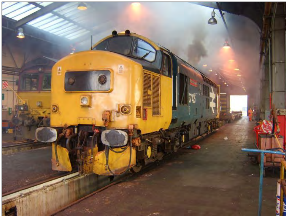
Allerton Shed