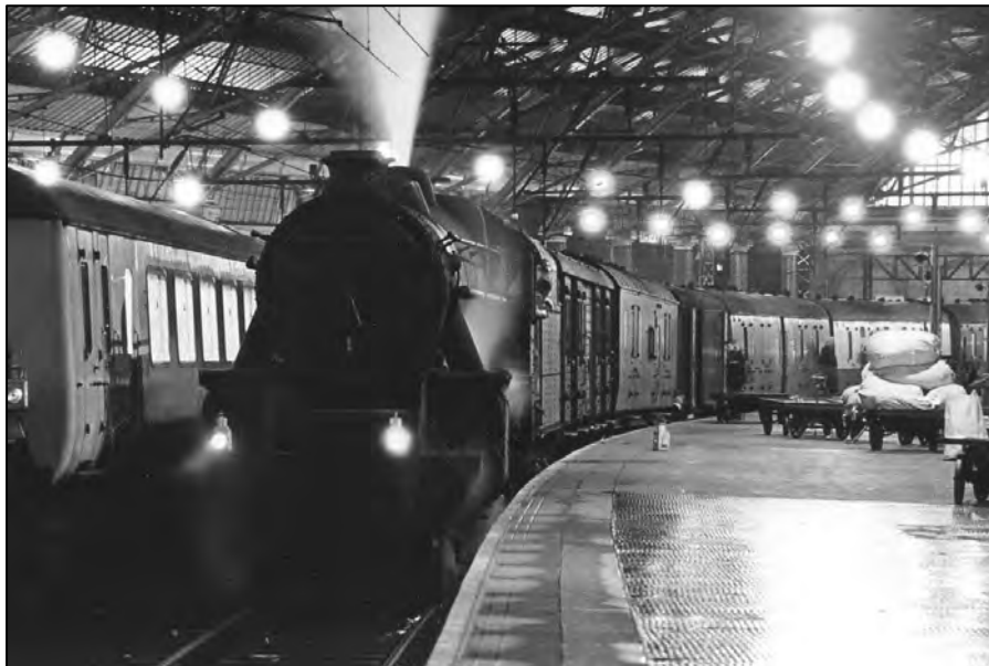
In the late evening of 4 September 1967, the 21.37 Manchester Victoria parcels service is loaded at Liverpool Lime Street platform 8.