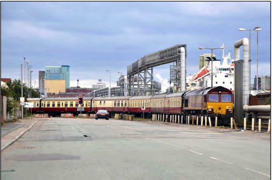
The UK Railtours special is seen arriving at Liverpool Docks on Saturday 24 June 2017.

On Saturday 22 July 2017, 46233 Duchess of Sutherland was used on the Cumbrian Mountain Express from Liverpool Lime Street to Carlisle and return. The train was diesel hauled to and from Crewe where it started with the Duchess on the rear. The following day, the same procedure was adopted for the North Wales Coast Express from Liverpool Lime Street to Holyhead which was hauled by Jubilee Class 45690 Leander.