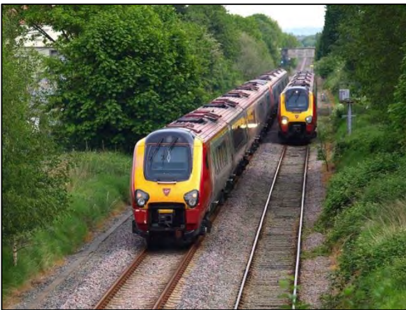
Left: Diverted passenger services at Middlewich on 16 May 2014.

Over the weekends of the 5/6 and 12/13 August 2017, the Virgin West Coast service between London Euston and Holyhead were diverted from Crewe to Chester via Sandbach, Middlewich, Hartford CLC and Mouldsworth. This was due to engineering work on the normal route via Beeston