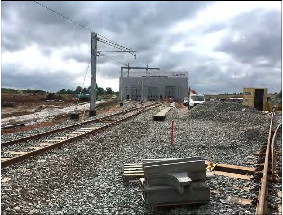
Looking west towards the Alstom Transport Technology Centre on 22 June 2017. The line between Ditton and the centre was receiving finishing touches and it can be seen to the left. The section of line to the right is the connection for the HBC sidings.

challenges which included declining industries, vast areas of contaminated land and a generally negative image that was not attractive to modern businesses. Over a thirty-year period, major projects were carried out to change this. New roads, public parks, housing and business areas were all developed and by the 21st century the area's fortunes started to change.