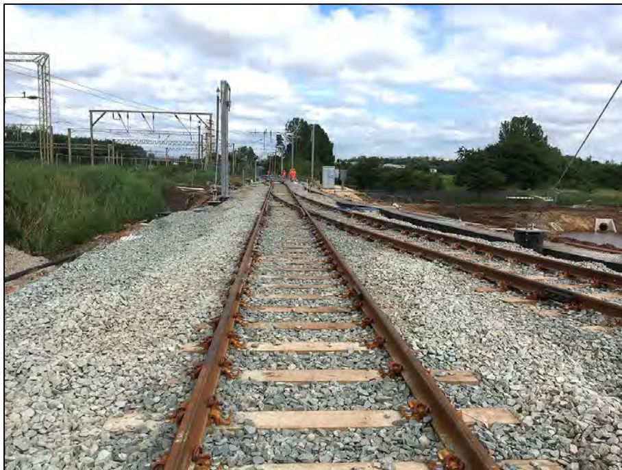
Looking east towards Ditton from the HBC siding spur line on 22 June 2017. The line to the right forms the connection to the Alstom works.

permission for a 1msqft Amazon warehouse. Following representations by the local community, the permission was quashed and the planning process was rerun.