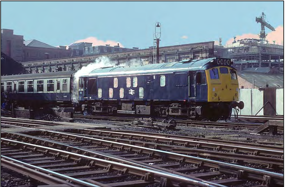
The Wirral Railway Circle 'Liverpool Exchange Farewell Rail Tour' is seen at Liverpool Exchange station on 9 April 1977. The tour was hauled throughout by class 25 locomotive number 25 066 of Wigan Springs Branch depot.

It has been 40 years since the Lyr terminus at Liverpool Exchange closed. The station closed for good on 30 April 1977. Unlike closures from the previous decade the closure of Exchange did not represent a railway system disappearing off the map. Basically, it was replaced by another station, Moorfields, which was part of a new underground system that revolutionised the railway network in Liverpool bringing great benefits to passengers.