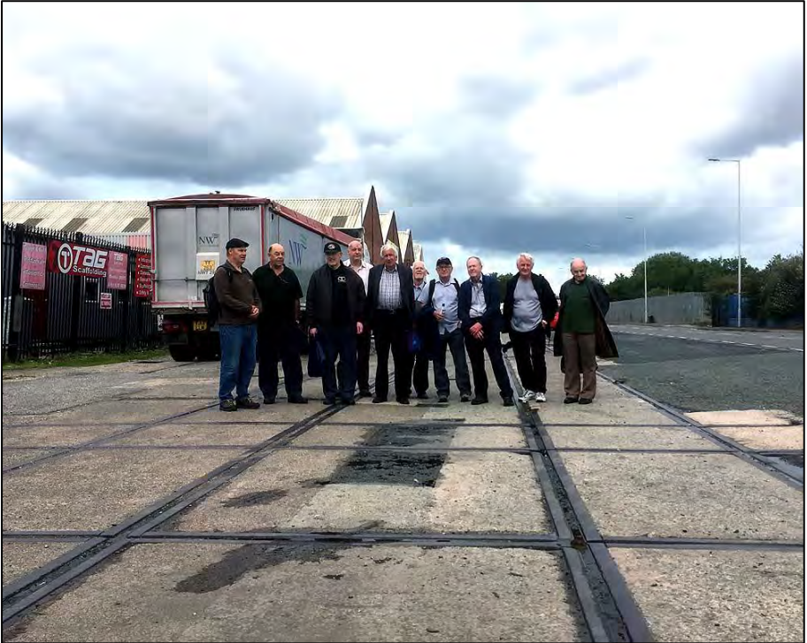
Members of the 8D Association during their visit to the Birkenhead and Wallasey docks on 22 July 2017.