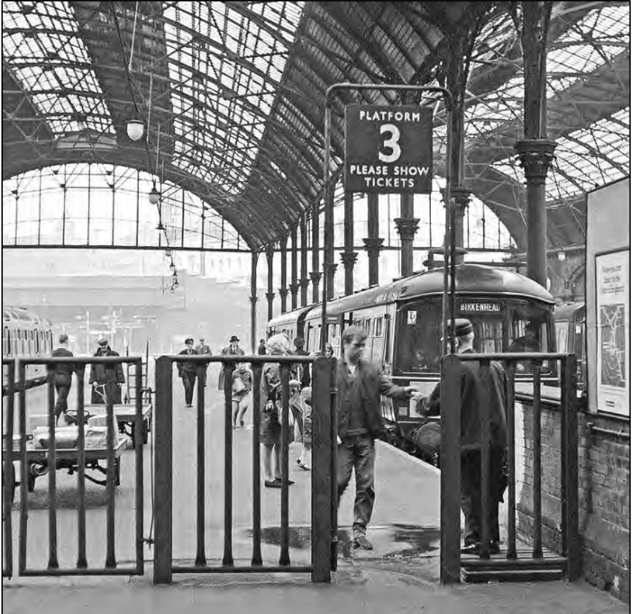
Birkenhead Woodside station s on 30 August 1967. This was the period when the station had lost its main line services and had only its Chester and Helsby locals. The number of passengers who have just disembarked from the Park Royal DMU show that the station was still popular.

Birkenhead Woodside was opened on 3 March 1878 by the Birkenhead Joint Railway a joint company of the Great Western Railway (GWR) and the London & North Western Railway (LNWR). It replaced a smaller terminus at Monks Ferry that had opened in 1844. The station was the northern terminus of the GWRs trunk route from Paddington to the north and great importance was placed upon it. The LNWR also valued Birkenhead Woodside and they ran a direct service to Euston from it.