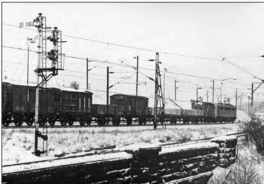
An electric hauled mixed freight is seen near to Pigue Lane, Edge Hill during the winter of 1967.