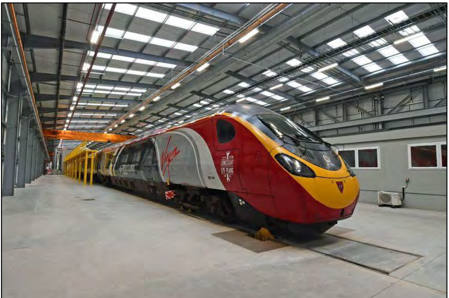
The end of the line. The western end of the shed at the Alstom Transport and Technology Centre seen on 29 June 2017.

Should Alstom be successful in winning some orders to build trains it will extend its facility at Halebank threefold. Widnes is set to become a railway engineering centre for the 21 st Century something that would have been unimaginable 30 years ago.