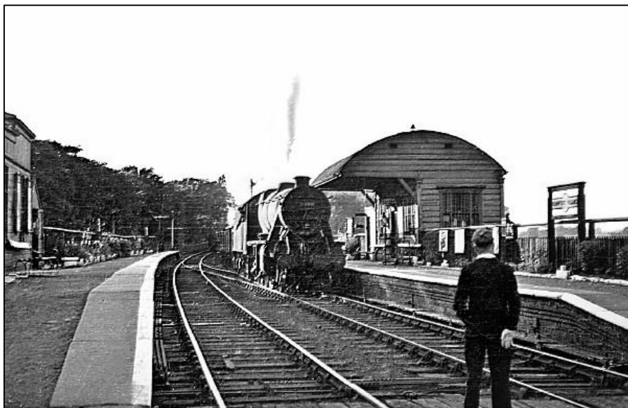
Rainford Village station in 1949. A goods train is seen passing south. It would have just come off the single line section and the signalman is seen waiting to collect the staff. The Healey Mills – Garston train worked by Rod Dixon would have handed over the Randle Junction – Rainford Junction staff in exactly this way.

When the train eventually arrived, we would relieve the Manchester crew then we started on our way. It was a single line from Randle to Rainford Village worked with a staff which we gave up at the Village signal box. From Rainford Village it was a normal double line to Gerard's Bridge signal box where the branch joined the main line into St Helens.