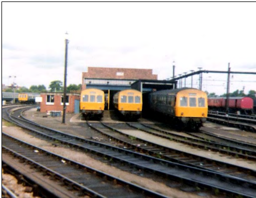
DMUs at Chester depot. It was from here that a Birkenhead Mollington Street driver collected the Park Royal DMU that would be destined to lose its door at Ledsham. When this view was taken, from a diverted Liverpool Lime Street – Paignton train in August 1978, there was a proliferation of Metro Cammell DMUs.

The Twin-Jib Tracklayer was to work independently on the `down` line and would lift out the redundant track panel on the `up` line, between the brake van and the rearmost `Salmon` vehicle ( the one with the replacement track panel on it ), and then lift this panel over the replacement panel, and place it on the other `Salmon` vehicle nearest to James Street Station and the Class 08 locomotive.