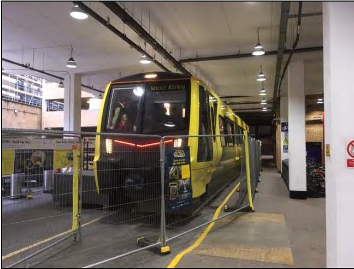
The mock-up of a class 777 EMU is seen at Liverpool Lime Street station on Saturday 10 November 2018.

The Merseyrail mock-up of the new Class 777 emu was on display at Liverpool Lime Street station from the 5th to the 18th of November. This had previously