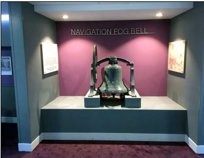
The navigation fog bell is seen in its new home at the Brindley Theatre on 11 October 2018.

After spending 150 years exposed to the elements the navigation fog bell which had once been a feature of the Runcorn Railway Bridge (Ethelfleda bridge) was