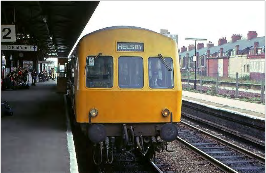
At 11.35 on 22 May 1979 Metro Cammell (Class 101) DMU number M56333 is seen at Rock Ferry prior to its departure for Helsby. At this time services to both Helsby and Chester were worked by crews from Birkenhead Mollington Street.

The driver was now required to walk to the office, and advise me of the unit numbers for the depot traction sheet, which was always kept on the Train Crew Supervisor's desk, and was a true record of what traction was actually stabled on the shed at any one time. It was a simple clipboard with a sheet of paper on it, and it had replaced the 'Engine & Train Arrangements Board', which was a feature of all Motive Power Depots in steam days. I will write more about the 'Engine & Train Arrangements Board' we had at Mollington Street in the next article.