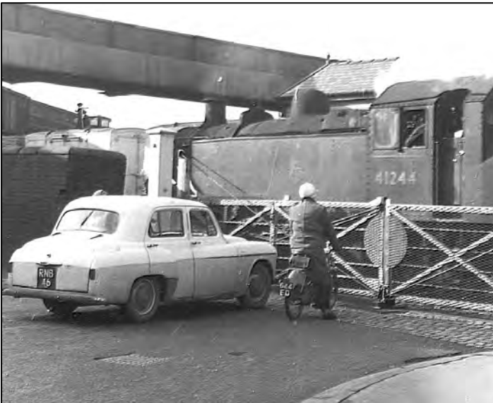
Road users are inconvenienced at Ann Street in 1961 as Ivatt 2MT locomotive number 41244 propels some insulated wagons over the level crossing. At that time the locomotive was allocated to Widnes Locomotive Shed (8D). It had entered service with British Railways at Rhyl Shed (7D) on 11 August 1951 and

was withdrawn from Aintree Shed (8L) on 22 October 1966.