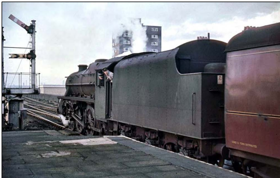
With a grubby 'black 5' at its head a Paddington to Birkenhead Woodside service is seen pulling away from Rock Ferry in 1967.

Exchange/Victoria when I was about 11 (knowing she would not) and spending an afternoon there. Delightful for a Southern trainspotter!