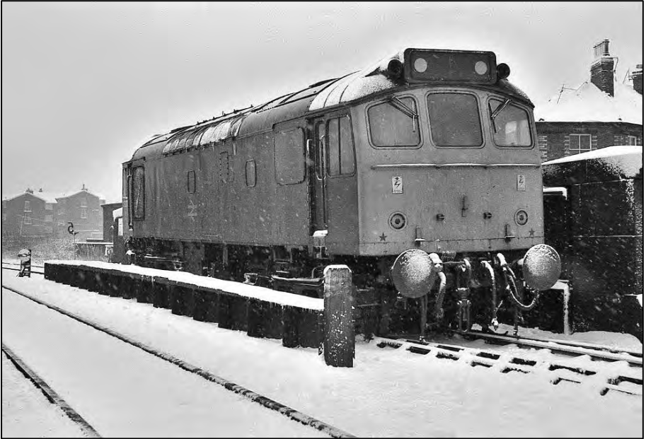
On a cold and snowy winters day class 25 locomotive number 25 277 is seen at Green Lane Junction. All is not as it seems as the locomotive was sitting on the ballast having become derailed when leaving Birkenhead Mollington Street depot.