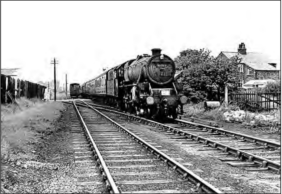
Looking north along the Rainford branch at the site of Old Mill Lane halt in the late 1950s. A diverted passenger service is seen heading south.

At a recent Farmers Market in Rainford I saw some old photos of Rainford Junction and Rainford Village stations and it reminded me of some of the work we had from Sutton Oak Depot in the late 1950s to the early 1960s.