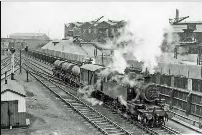
Left: Ivatt 2MT locomotive 41237 heads south through Widnes Dock Junction with a short train consisting of one box van and three chemical tanks in the early-1960s.

Another year draws to a close. Once again we have had some excellent visits,