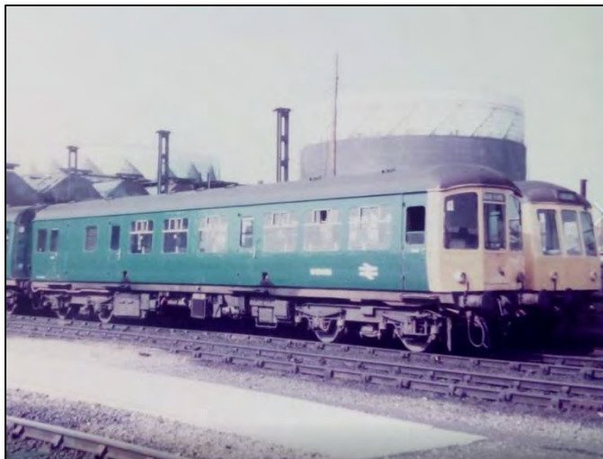
was A Park Royal and a Derby Lightweight DMU at Birkenhead Mollington Street Shed on 14 September 1982.

always unfailingly polite when he spoke to anyone. However, he was always more than a little concerned if a class of locomotive not normally seen