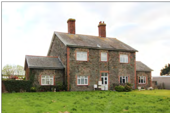
The former Sudbrook infirmary built by the Great Western Railway for the welfare of their staff who lived and worked at Sudbrook Pumping Station

an emergency occurring in the tunnel. We expected him to dismiss this out of hand but he thought it was a wonderful idea and that a number of his staff would jump at the chance to be both driver and guard if needed. This was excellent news. The next step was to convince the NUR, ASLEF and railway engineering trade unions of the benefits of this proposal. I recall thinking that this would not be at all easy. I was right !