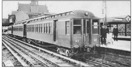
An electric train at Birkenhead Park on the Mersey Railway (post 1903)