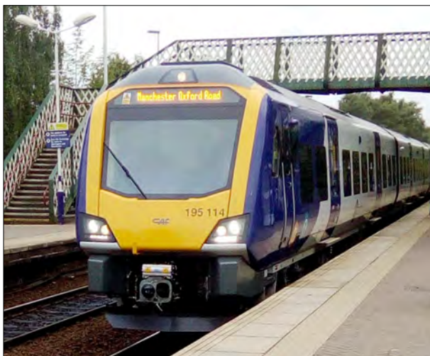
Northern Class 195 number 195.114 arriving at Widnes on Saturday 13th of July, forming the late running 1042 07.09 Liverpool Lime Street to Manchester Oxford Road service.

1F28 was involved in more late running on 25th July, when it departed at 22.59 from London Euston, reaching Runcorn at 01.11 eventually arriving in Lime Street at 01.29, 116 minutes late.