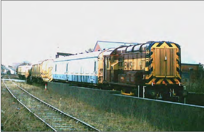
Photograph showing the Severn Tunnel Emergency Train shunting on the Sudbrook Branch.