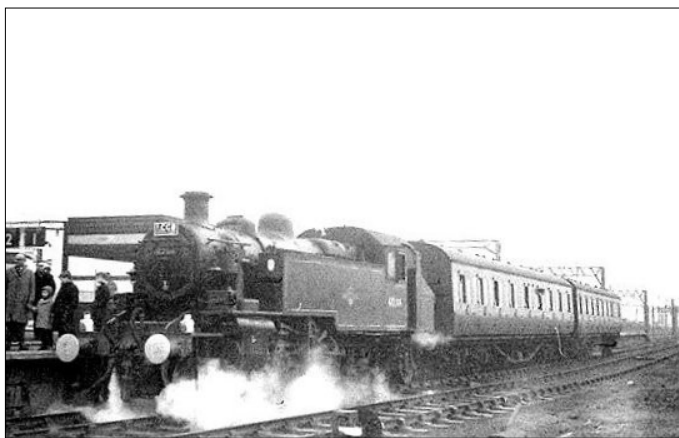
Not the Stanier 2-6-4T that Colin and his driver worked, but a similar locomotive (Ivatt 2P No.41286) preparing to leave from Platform 1 at Ditton Junction.

After coupling up to the carriages at Ditton Junction, the train departed from Platform 1, calling at Runcorn, and then proceeding over the Halton Curve to Frodsham Jct before stopping at Frodsham and Helsby where we handed over our train to a Chester crew who brought the 06.25 service from Chester to Liverpool Lime Street service as far as Helsby. The Chester crew then took the Ditton train through to Birkenhead Woodside. The engine that Lol and I took over from the Chester crew was also a Stanier tank (No.42606 of 8B