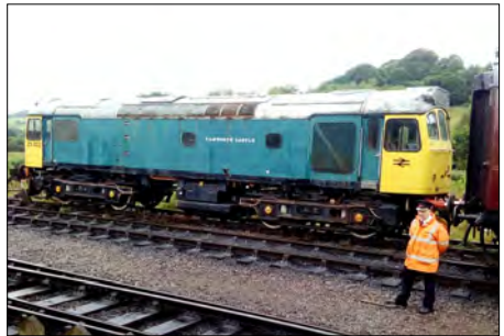
Class 25 25322 Tamworth Castle. The locomotive is stabled at Cheddleton.