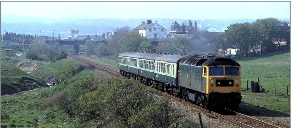
A view looking south from The Bongs in Widnes on 13 May 1979. Heading north along the former St Helens & Runcorn Gap Railway is the diverted 09.40 Liverpool – Glasgow Central service. Scheduled passenger services over this line had ceased in 1951.