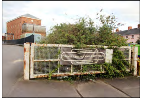
Above : Post Office No.1 user-worked level crossing. Note the Pumping Station at top left of the photo. Below : Post Office No.2 user-worked level crossing.

In particular, there were three user-worked gated level crossings on the Sudbrook branch.