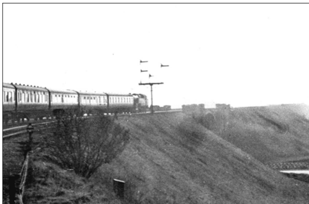
A tank engine and its train at Frodsham Junction in March 1955. The train is heading for Helsby.

closure of Speke Jct shed in January 1968. Widnes shed continued to provide locomotives for freight and local trip workings until its closure on the 13th of April 1964. At that time, many drivers and fireman either left the railway or transferred to Speke Jct or Warrington Dallam sheds.