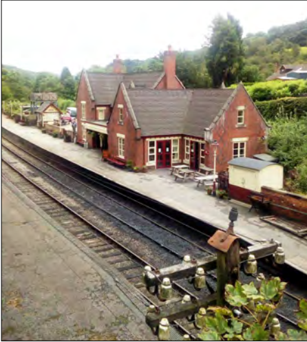
Kingsley and Froghall railway station is a former station of the North Staffordshire Railway (NSR) and is now a preserved station on the Churnet Valley Railway.

For the run from Cheddleton to the present end of the line at Ipstones, the train had been increased to 7 carriages as 2 more vehicles