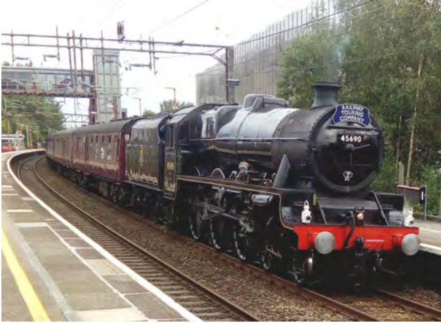
Taken on Sunday 21st July, the photo shows Jubilee class locomotive 45690 Leander arriving at Runcorn on 1Z76 10.55 Liverpool Lime Street to Holyhead 'North Wales Coast Express'. Leander hauled the train throughout.